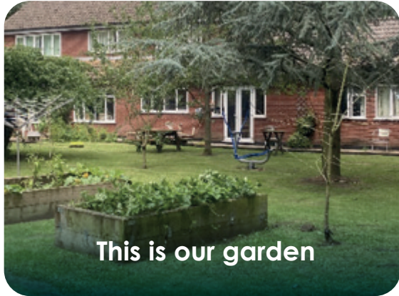
This is our garden