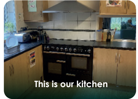
This is our kitchen