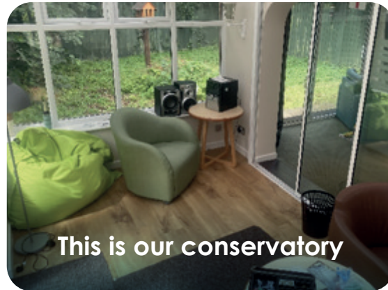
This is our conservatory