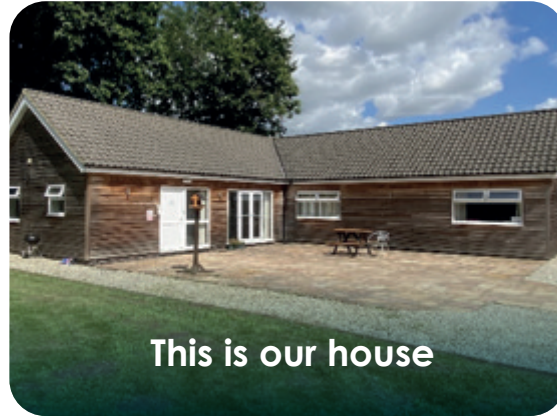
This is our house