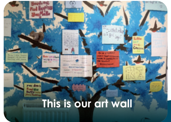
This is our art wall

Lombard House, Anchor Corner, Attleborough NR17 1JY