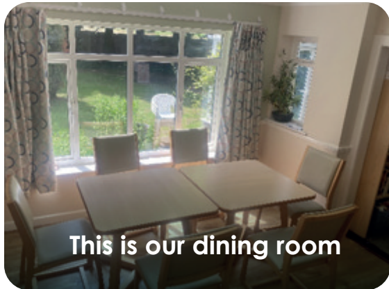
This is our dining room