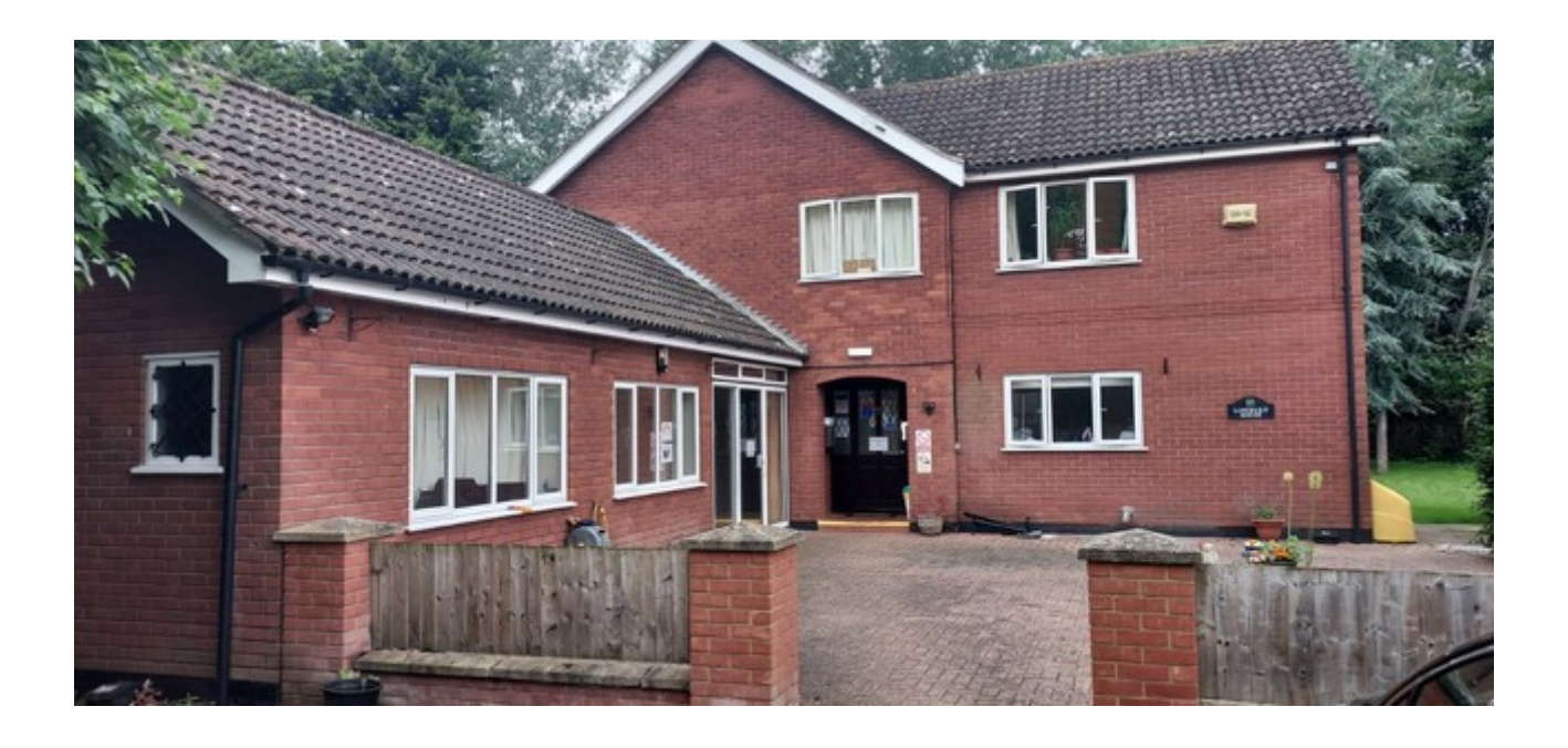
Booklet designed by patients.